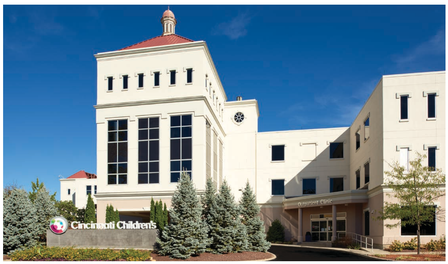
Cincinnati Children's College Hill Campus