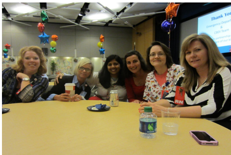
Emergency Department and CBDI Staff celebrate their successful teamwork

Our patients may need to return to the hospital if they develop an infection or fever. Thanks to cooperation between Cincinnati Children's CBDI and the Emergency Department, we are able to treat infections rapidly, even faster than recommended health care guidelines.