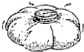
Commercial Cold Pack