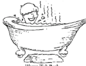
Warm Tub Bath