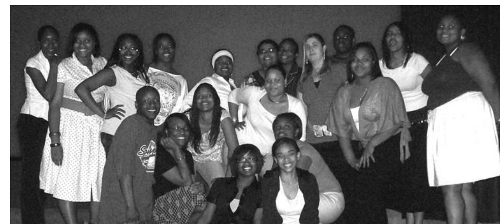
Senior PSI teen leaders pose at May 2007 banquet

Research on developmental assets suggests that kids who respect different viewpoints are more likely to lead healthy, productive lives. In a June 2007 exit survey, 100% of graduating PSI teen leaders reported that it is easy for them to respect someone whose opinion about postponing sex differs from their own. As a result of the teen leadership experience, one senior teen leader wrote, "I've grown as a person. I've become more tolerant."