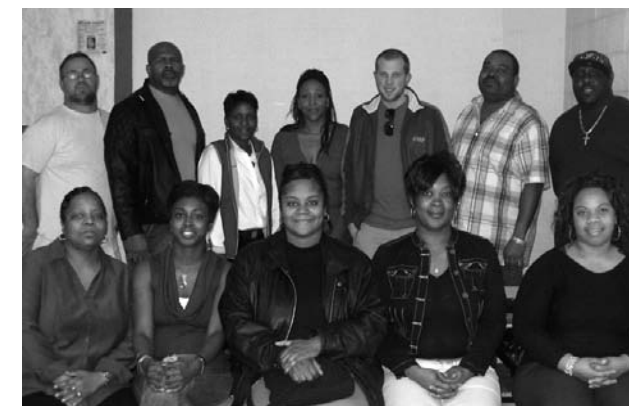
Teen leader parent panel

Leadership means service. Teen leaders fulfilled a new responsibility to perform at least six volunteer hours of raising community awareness for PSI.