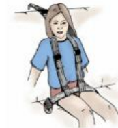
86-Y Universal Harness E-Z-ON 86Y HARNESS 66-168 lbs