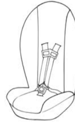
COMBINATION SEAT (Harness car seat plus a booster seat) Look for model with little to no wings Varies by model: Harnesses 30-40 lbs Varies by model: Booster 40-80/100 lbs