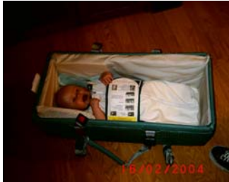
SNUG SEAT CAR BED Birth – 20 lbs