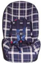
AIRWAY FF ONLY 22-50 lbs