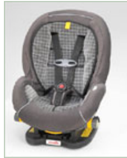
Evenflo TRIUMPH RF 5-30lbs/FF 20-40lbs