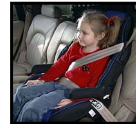
HIGH BACK or NO BACK BELT POSITIONING BOOSTER Look for model with little to no wings. Varies by model: 30+-80/100 lbs