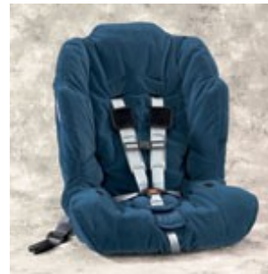
Britax HUSKY, REGENT FF only 22-80 lbs Britax TRAVELLER PLUS FF ONLY 22-105 lbs