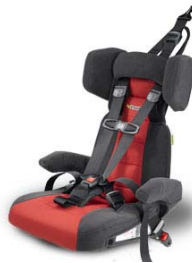
SAFEGUARD GO FF ONLY 30-60 lbs BOOSTER 40-100 lbs