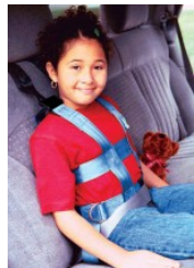
E-Z-ON VEST 20-168 lbs, 2yrs-adult