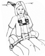
E-Z-ON KID-Y HARNESS With RIDE RYTE BOOSTER FF only 30-80 lbs