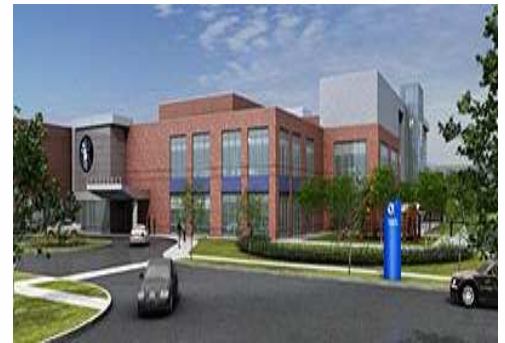
Clinic located on the 3rd floor. Always on Top!

For more information & map: www.cincinnatichildrens.org/liberty