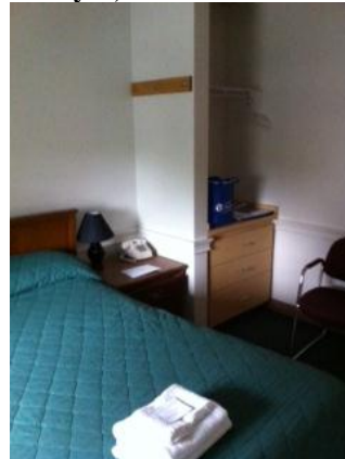
Above right: Each room comes furnished with a bed, bed linens/towels, dresser, chair and nightstand.