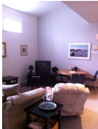
Above right: This is a shared common area with television.