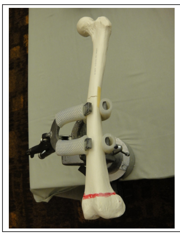
Femoral Model used in Simulation Lab

CCHMC will invoice and payment is due 1 week prior to commencement of observership.