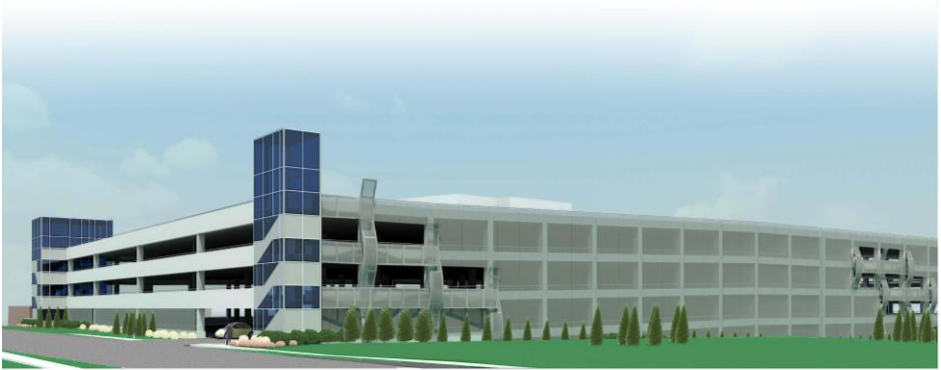
VIEW FROM INTERSECTION OF ERKENBECHER & HARVEY