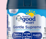
Good Start Gentle Supreme®