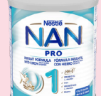
Nestle NAN Pro 1®