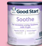
Gerber Good Start Soothe®