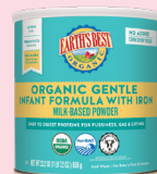
Earth's Best Organic Gentle®

ALSO LOOK FOR STORE BRANDS WITH THIS IN THE TITLE: