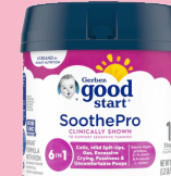
Gerber Good Start SoothePro®

ALSO LOOK FOR STORE BRANDS WITH THIS IN THE TITLE: Complete Comfort, Gentle