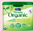
Enfamil Simply Organic®