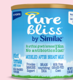
Pure Bliss by Similac®