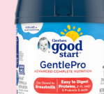
Good Start GentlePro®