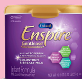
Enfamil Inspire Gentlease®