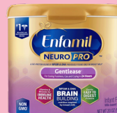
Enfamil NeuroPro Gentlease®