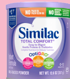
Similac Total® Comfort