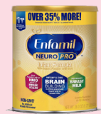
Enfamil NeuroPro Infant®