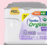
Similac Organic Gentle A2®