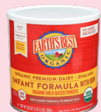
Earth's Best Organic Dairy®